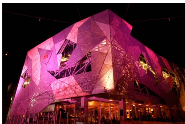
Federation Square, Melbourne

Internationally, over 40 cities have participated in the Global Illumination including London – Kensington Palace; Washington D.C – The White House; Cape Town – Table Mountain; New York – Empire State Building; Ontario – Niagara Falls and Jerusalem – Museum of Art.